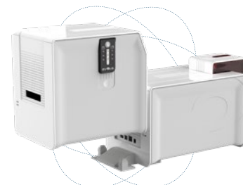
Quick Installation and Connection Via Infrared