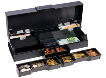
Filled cassette with separated inserts

The design of the established SCC has been retained. The coin insert can be removed completely. Coin cups from the previous SCC version can still be used without any problems.