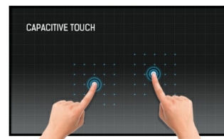
Touch technology - Capacitive

IPS displays are best known for wide viewing angles and natural, highly accurate colours. They are especially suited for colour-critical applications.