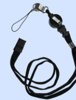
Neck Strap SKU: WR10-STRP-N01

Ring Trigger with finger strap (If you purchased the “Ring Trigger package”, you do not need to purchase it separately.)