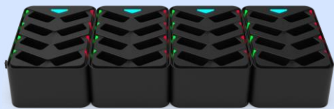
32-Slot Battery Charger SKU: WR10-32BC-U00

Ring scanner battery (1,000mAh) * 10 pcs