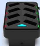
8-Slot Battery Charger SKU: WR10-08BC-U00

For the power supply, use the SKU: WR10-PWSP-4EU (=UNIV-PWSP-8EU) (100~240VAC, 12VDC, 7A)