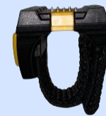
Ring Trigger SKU: WR10-TRIG-S00

For the power supply, use the SKU: WR10-PWSP-1EU (100~240VAC, 12VDC, 3A)